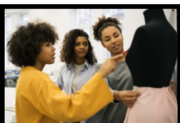
The 'Designed for Business' competition's star prize is £30,000 cash for one lucky student.

Competition Education Fashion Interiors What's On UK