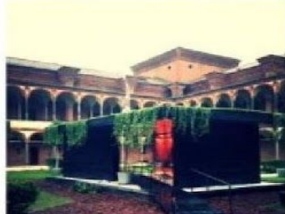
Milan Design Week 2013 and Be Open founder Elena Baturina