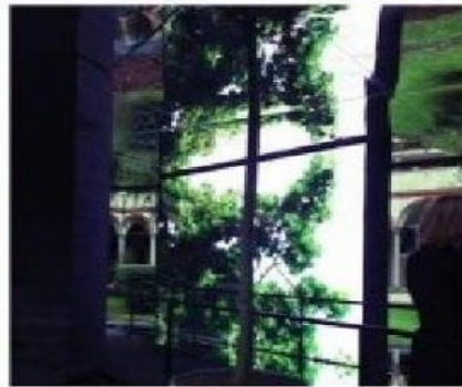
Milan Design Week 2013 and Be Open

The demand for architecture and design to push the boundaries of sensory perception - as well as being sustainable, environmentally friendly and suitable for an urban setting - has not only created a hybrid form of industry but has also catalysed technological innovation.